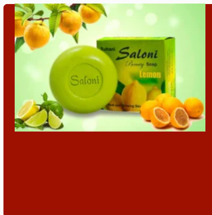
Saloni beauty Lemon Soap 125 gram