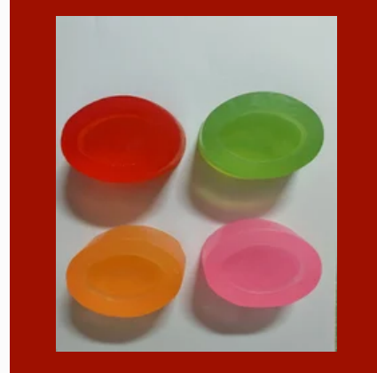
Body Wash Bar