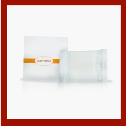
Hotel Guest Soaps