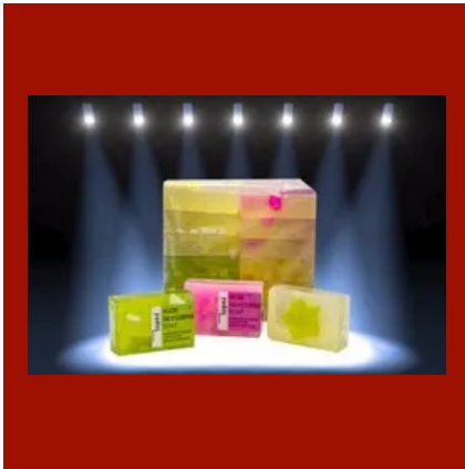
Glycerine Bath Soap cubes