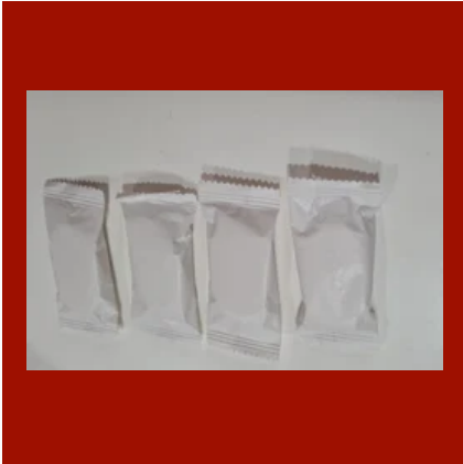
Hotel Guest Soaps