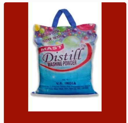
Distill MAST Detergent Washing Powder