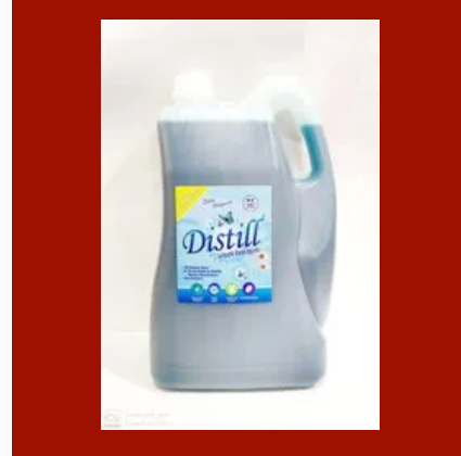
Distill Liquid Detergent 5 Litre