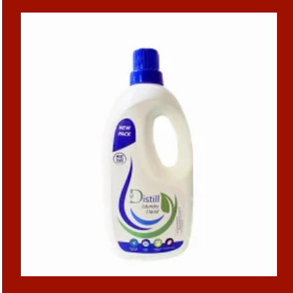
Distill Detergent Liquid