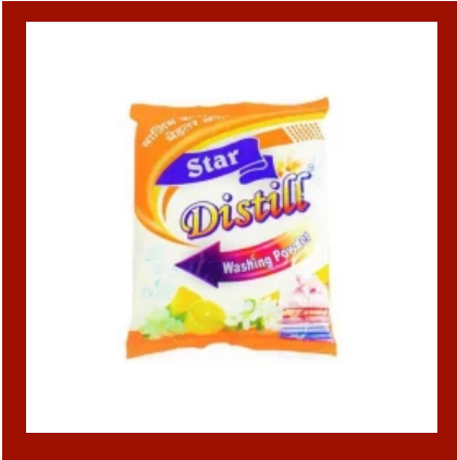
Distill Star Washing Detergent Powder