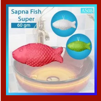
Suhana Sapna Hanging Soap