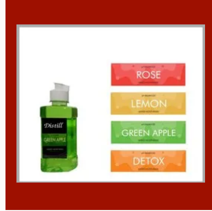
Distill Hand Wash