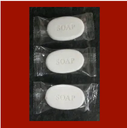
WHITE HOTEL SOAP