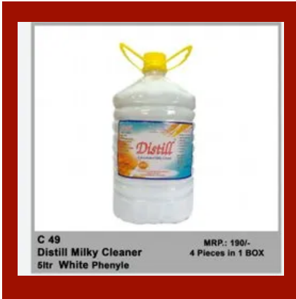
Distill WHITE Milky Floor Cleaner