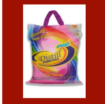
Distill Regular Detergent Washing Powder