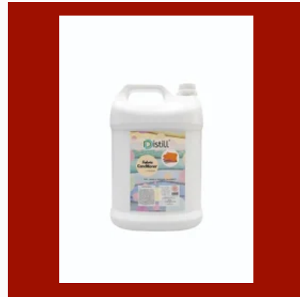
Distill Fabric Conditioner