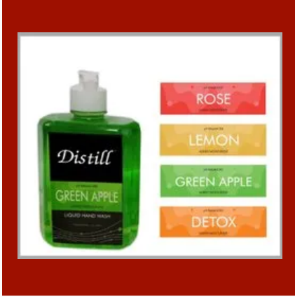
Distill Hand Wash 500ml