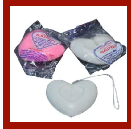
Suhana Sapna Hanging Soap