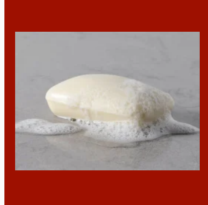
Hotel Bath Soap