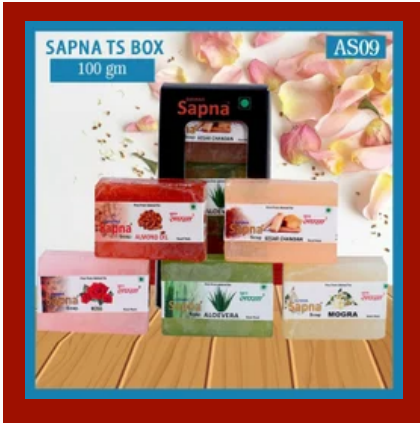
Suhana Sapna Glycerine Bath Soap