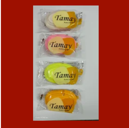
50gms Tamay Beauty Soap