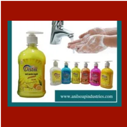
Distill Hand Wash 250 ml