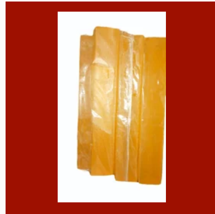
Natural Glycerine Transparent Soap Base