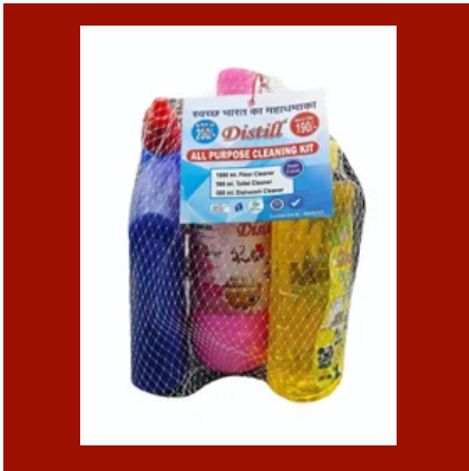
Distill Combo TC- DW- FC