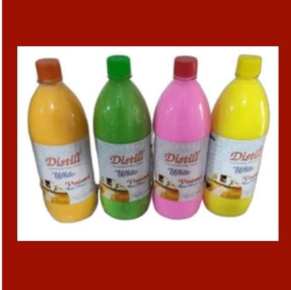
DISTILL Perfumed Liquid Floor Cleaner