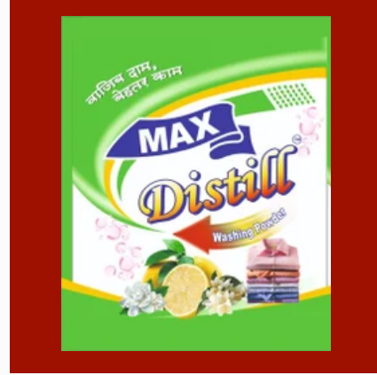
500 Gm Detergent Powder