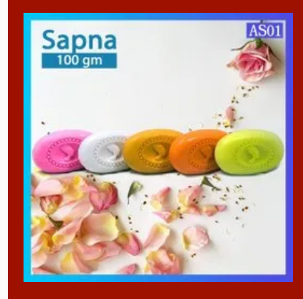
100gm Suhana Sapna Beauty Soap