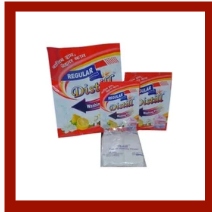
Distill Regular Detergent Washing Powder