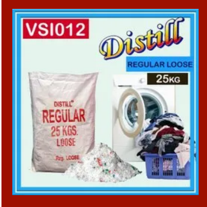
Distill Regular detergent powder Loose