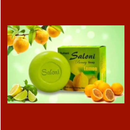
Saloni beauty Lemon Soap 125 gram