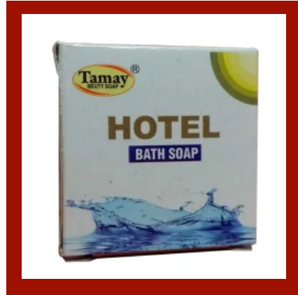
Tamay Hotel Soap