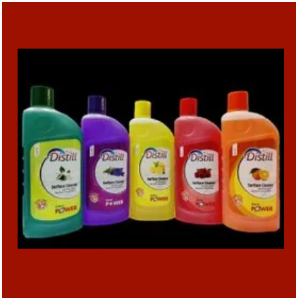
Distill Surface Cleaner 500 ML