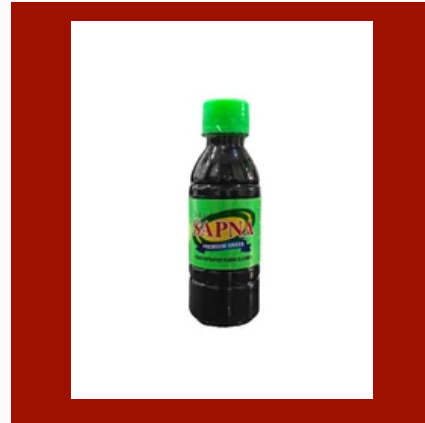
Sapna green concentrate 200 ml phynyle