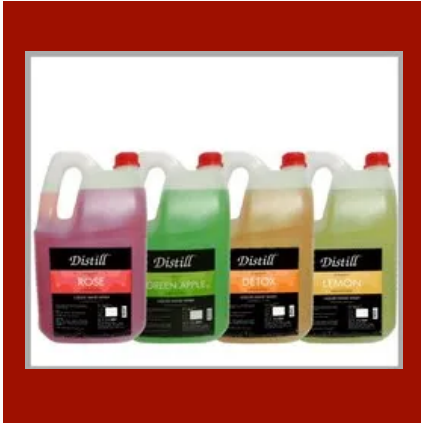
DISTILL Hand Wash 5 litre