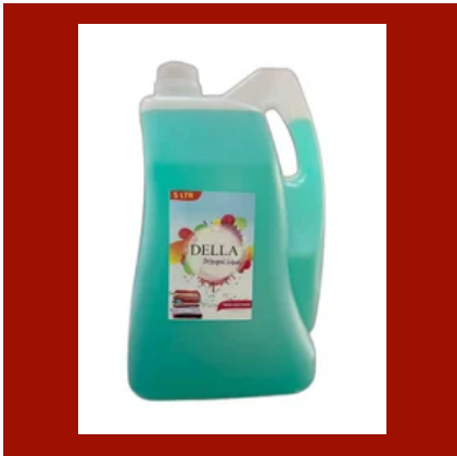
DELLA LIQUID DETERGENT