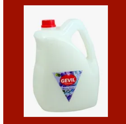
Jevil Hand Wash