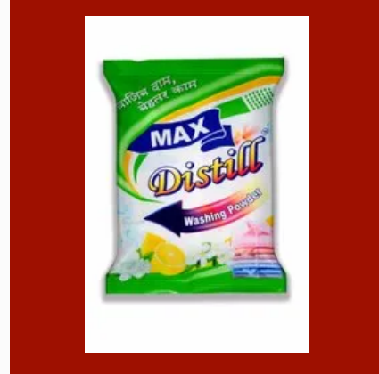
Distill New Detergent Powder