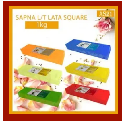
Suhana Sapna T/S Square Glycerine Soap