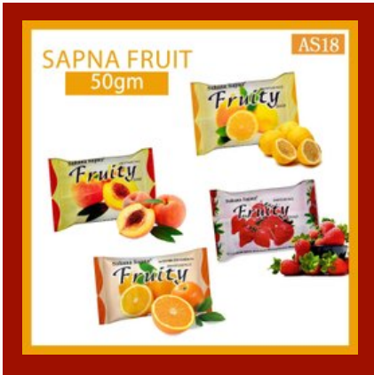
50gm Suhana Sapna Fruity Beauty Soap