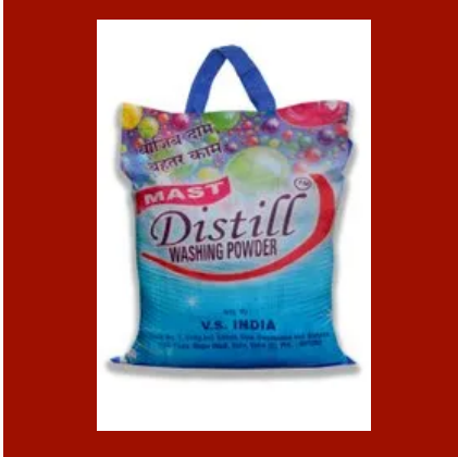
Distill MAST Detergent Washing Powder