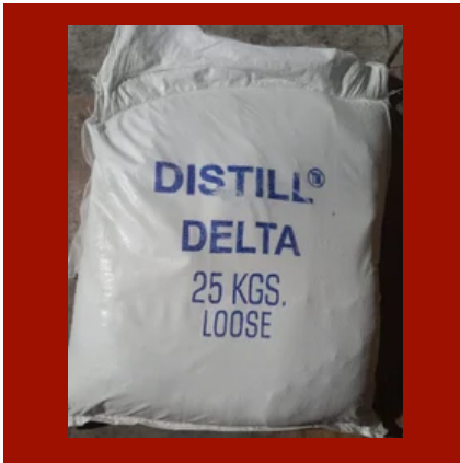
DISTILL DELTA LOOSE DETERGENT POWDER