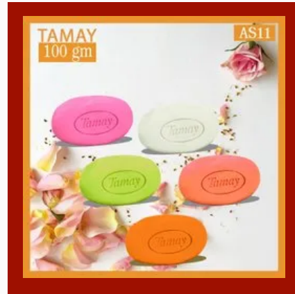
100gm Tamay Beauty Soap