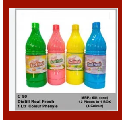
Distill Real Fresh Floor Cleaner