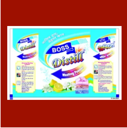
Distill Boss Detergent Powder