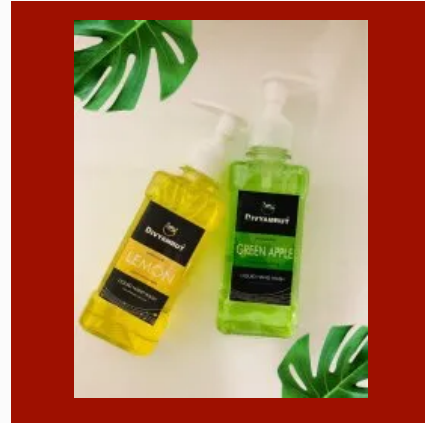
Hand Wash With Dispenser Pump