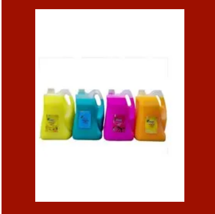
Super Rich Hand Wash