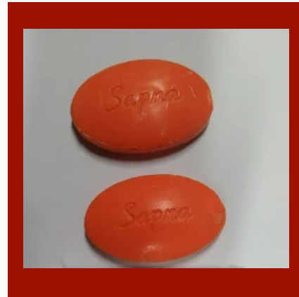
Sapna Fruity Soap