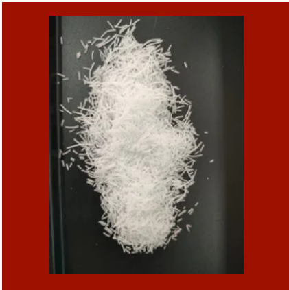
SIs Noodles Detergent cleaning powder