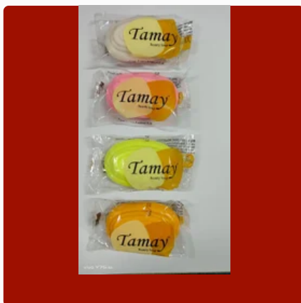
50gms Tamay Beauty Soap

We are among the prominent manufacturers of a wide assortment of Bath soap and detergent powder . These are getting widely acclaimed among the clientele for their high purity and safe packaging.