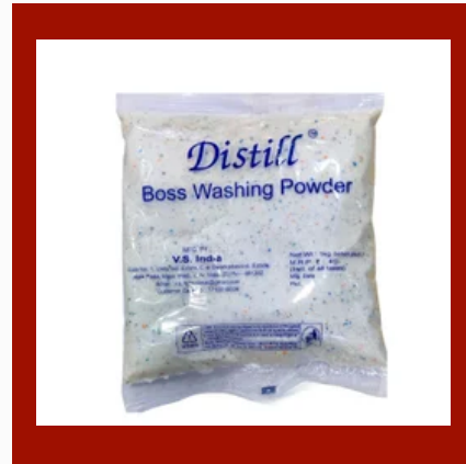
DISTILL BOSS DETERGENT POWDER